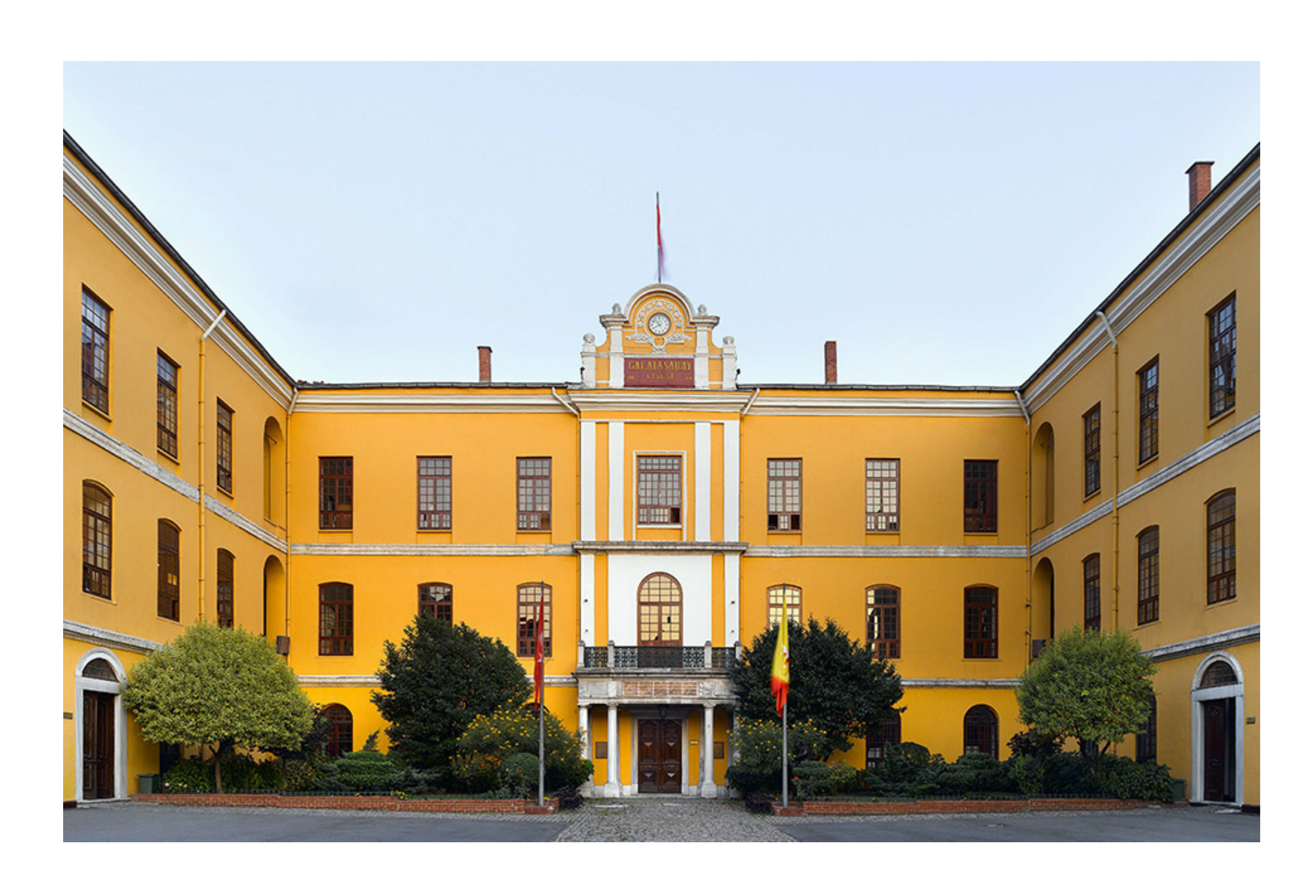
Galatasaray High School (Istanbul/Turkey)