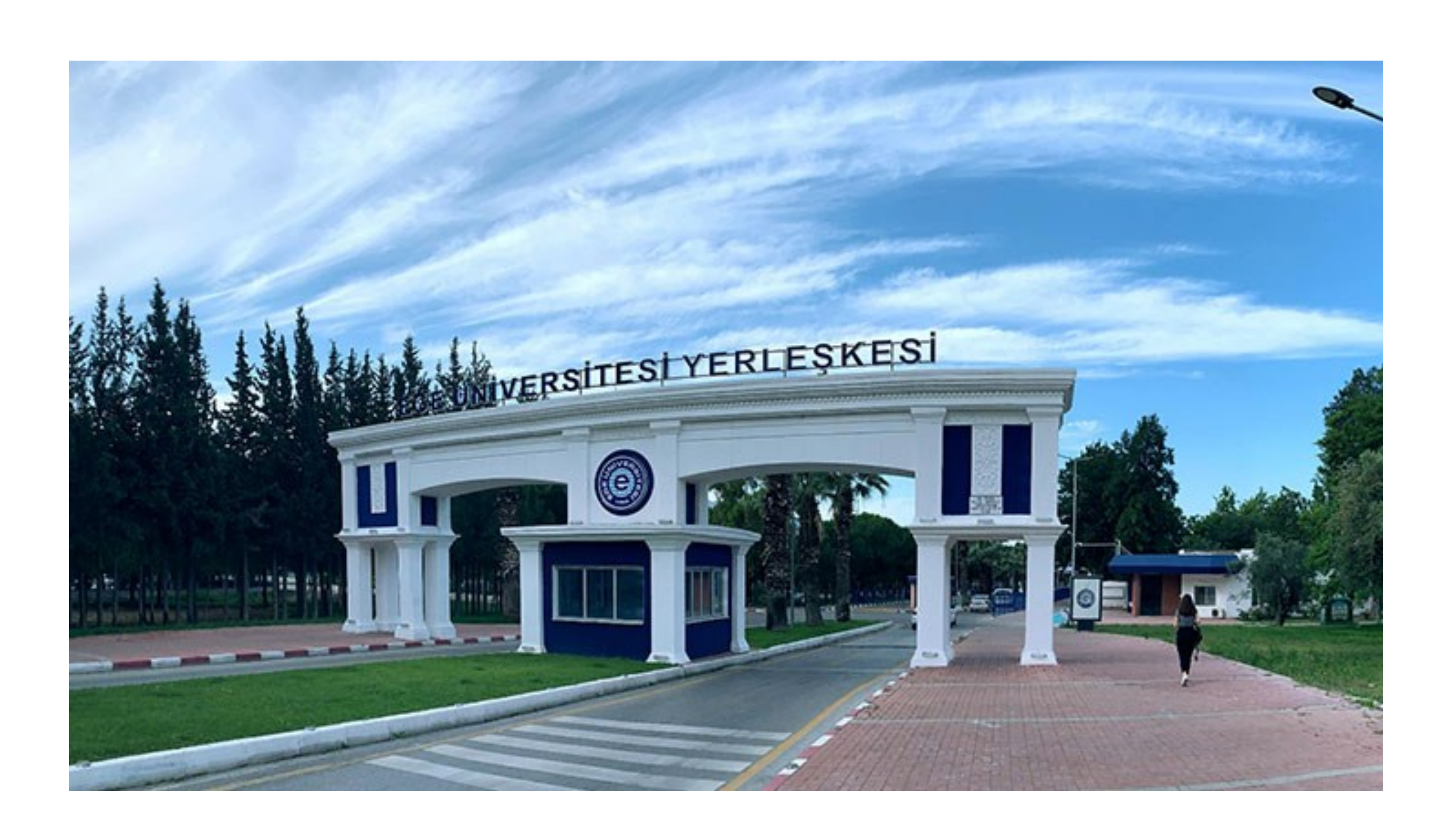
Ege University (Izmir/Turkey)