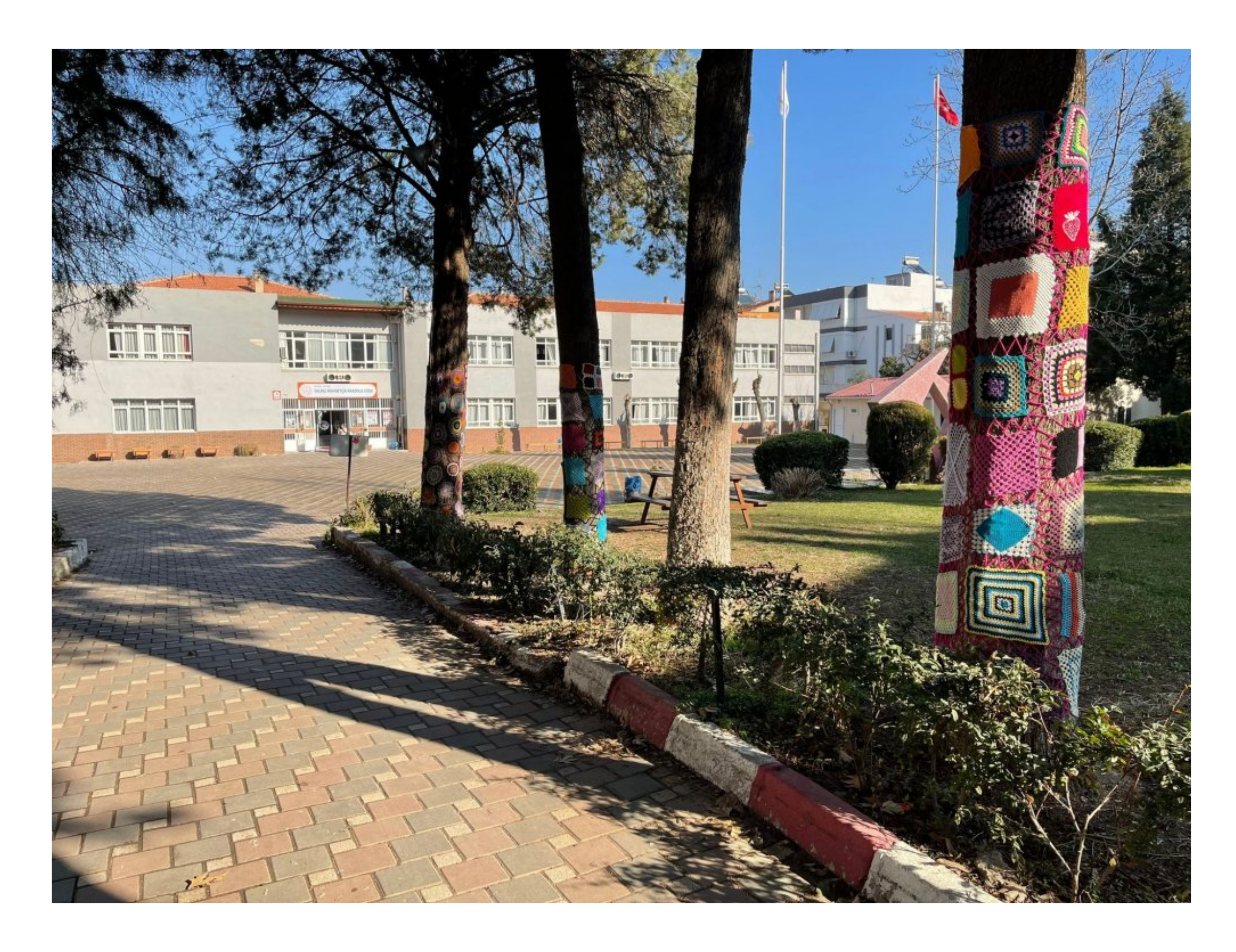
Salihli Mehmetçik Anatolian High School