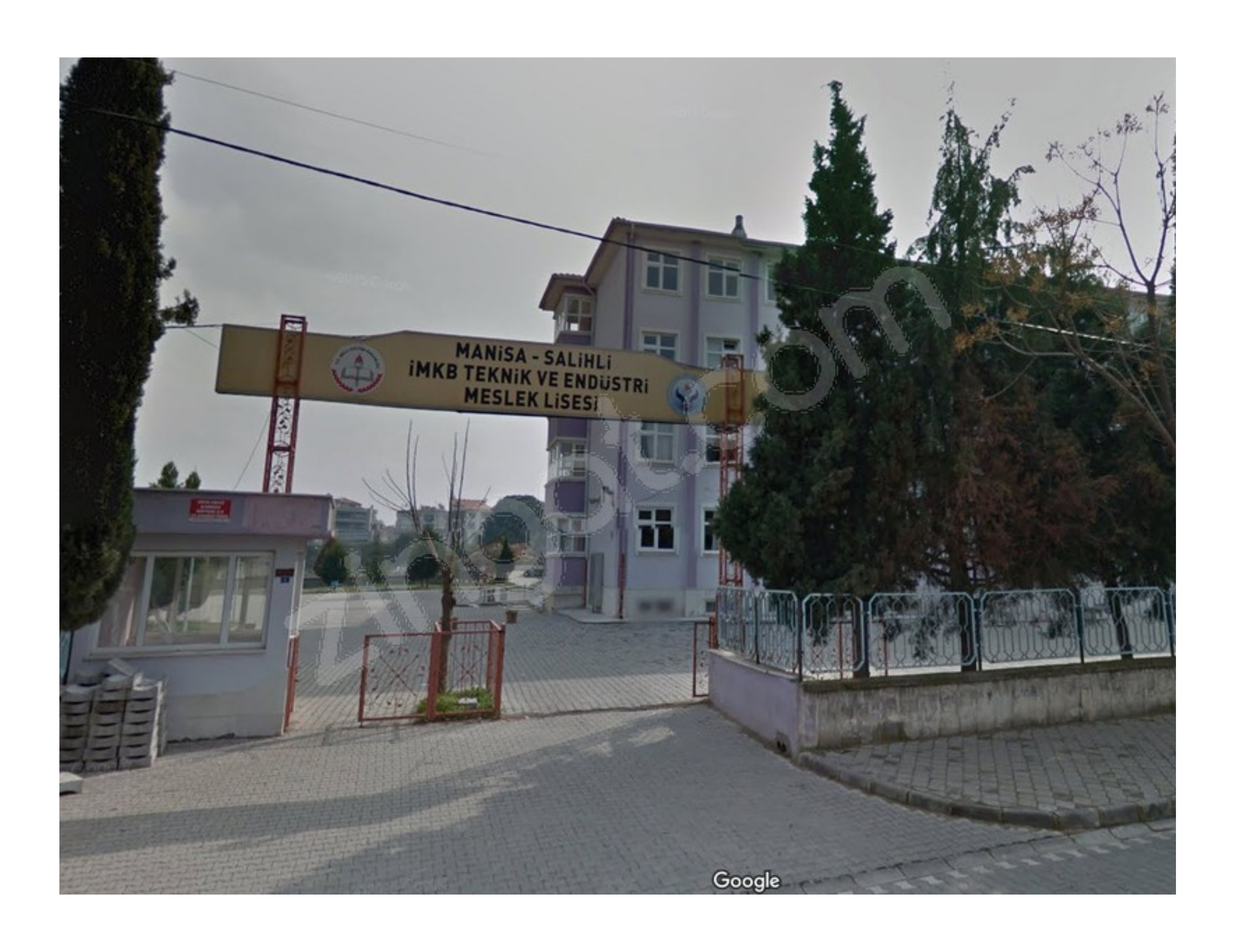
Manisa-Salihli İMKB Vocational and Technical Anatolian High School

• In Anatolian high school, students choose their departments as TM (Turkish-Mathematics Equal Weight), MF (Mathematics-Science Numerical Weight), TS (Turkish-Social Verbal Weight) and LANGUAGE (English Weight) after the second (10th) grade of High School to attend the courses in their field. starts.