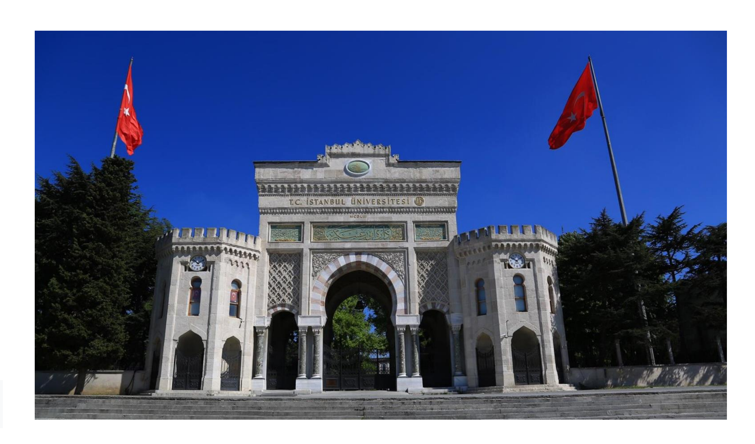
University of Istanbul (Istanbul/Turkey)